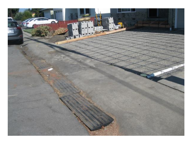
19216 Ricardo Ave., Hayward