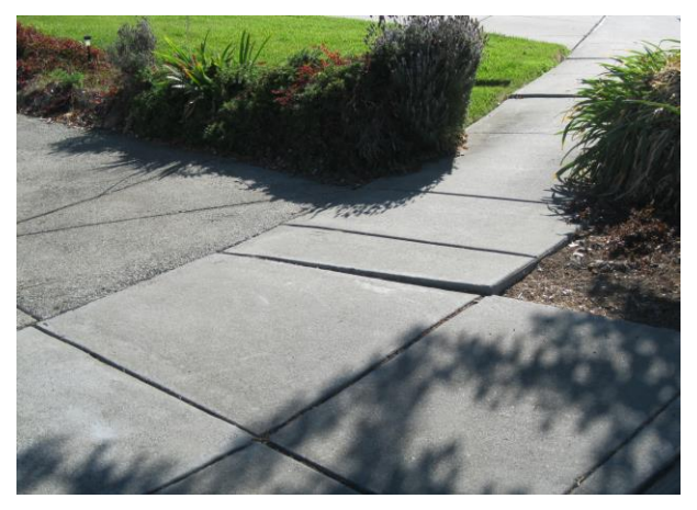
25736 Cloverfield Ct., Castro Valley