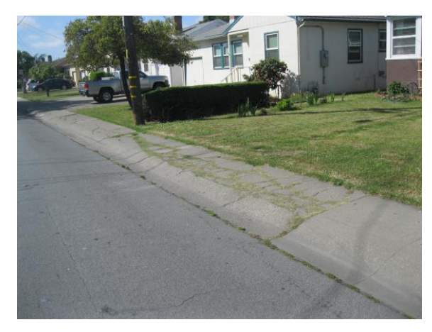
15921 Via Alamitos, San Lorenzo