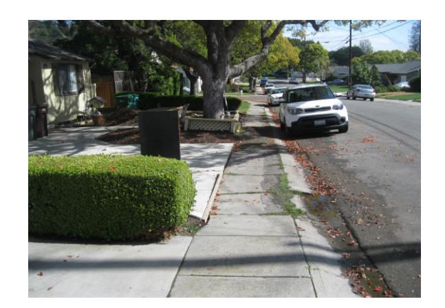
16150 Windsor Dr., San Leandro